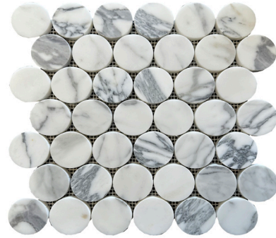
2" Dot Honed 3/8" thick ARABESHDOT2