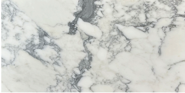
12" x 24" Honed/Polished 12" x 24", 3/8" thick ARABH1224 ARABP1224