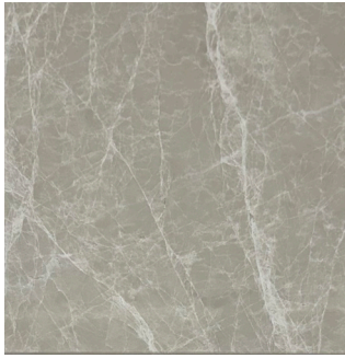
12" x 12" Honed 12" x 12", 3/8" thick SGH12