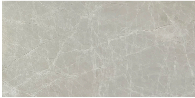
12" x 24" Honed 12" x 24", 3/8" thick SGH1224