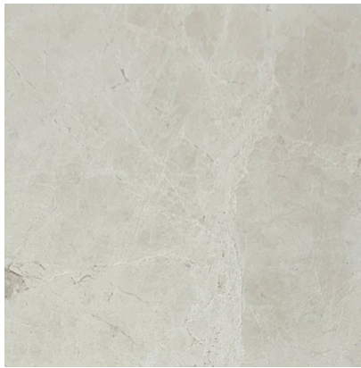
18" x 18" Honed 18" x 18", 3/8" thick VIH18