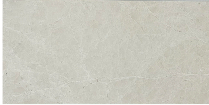
12" x 24" Honed 12" x 24", 3/8" thick VIH1224