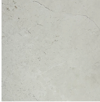
12" x 12" Honed 12" x 12", 3/8" thick VIH12