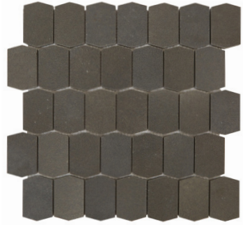
Adelaine Hexagon High Honed 11.88" x 11.81", 3/8" thick BASHHEXAD