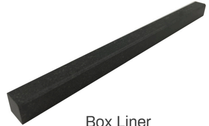
Box Liner High Honed 3/4" x 12", 3/4" thick BASHBOXL