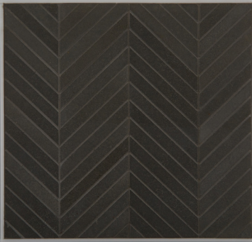
Chevron High Honed 11.02" x 13.58", 3/8" thick BASHCHEV