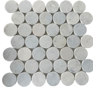
2" Dot Polished 12"x12.375" 3/8" thick CBPDOT2