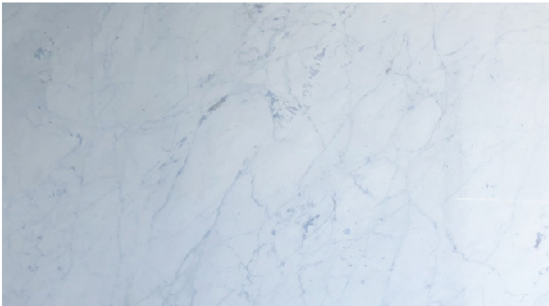
3cm Slab Polished Custom Size, 3 cm thick CBPSLAB3