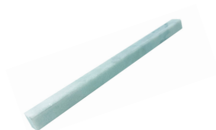
Box Liner Polished 3/4" x 12", 3/4" thick CBPBOXL