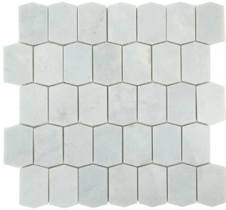
Adelaine Hex Polished 11.75" x 11.875", 3/8" thick CBPADHEX