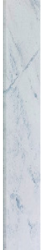
Saddle Polished 4" x 36", 3/4" thick CBPSAD436